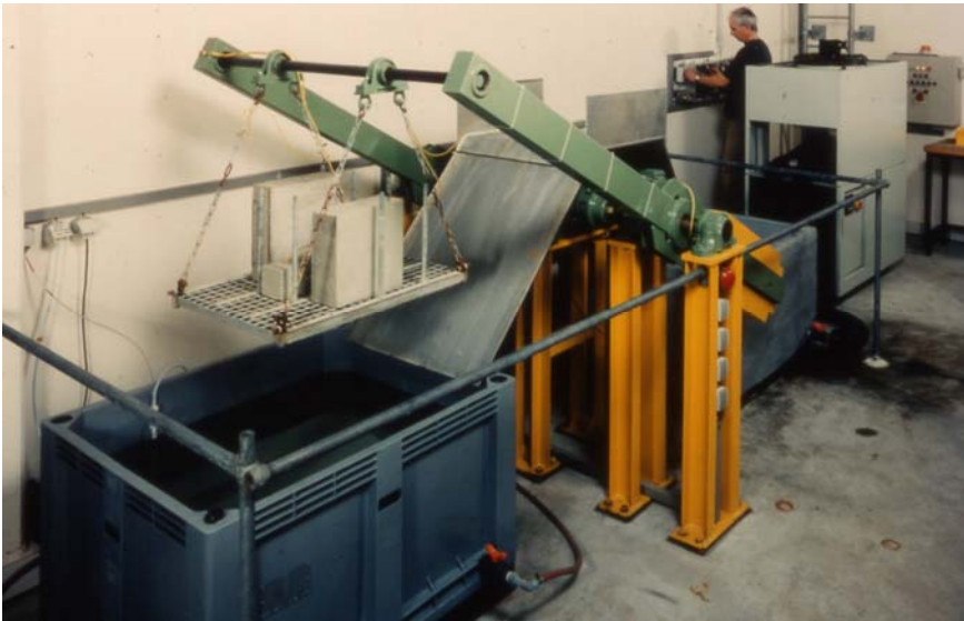
View on the facility (in front the tempered basin with 20^{\circ}\text{C} up to 23^{\circ}\text{C} )

Other stress combinations are also available (e.g. water/aeration (air) or area irradiation with radiant heater).